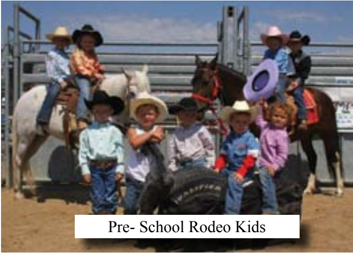
Pre- School Rodeo Kids